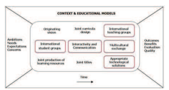
Figure 2. Virtual mobility features

In this context, we can identify three main dimensions in the aim of increasing the potential use of Virtual Mobility. Figure 3 shows the policy, research and community of practice dimensions and related concepts related within.