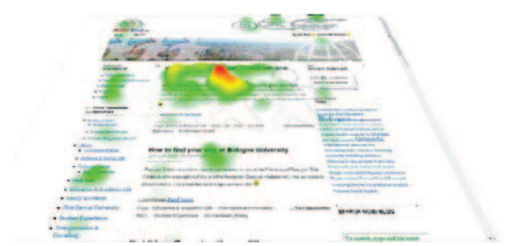
Figure 1. Heatmap of mobi-blog website

Also, the study was supported with a usability analysis (with eye-tracking methods) to understand what user are really interested when they are looking the website. Figure 1 shows the most viewed part of the website, to understand what is relevant for visitors.